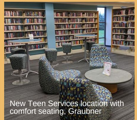
New Teen Services location with comfort seating, Graubner

"The investment our community library employees are willing to make in their patrons - taking time to get to know each individual's unique needs and interests - is a special gift. Our hometown libraries have a charm that surpasses other libraries we have visited across the country, especially in the people who work here, the educational programs and the activities."