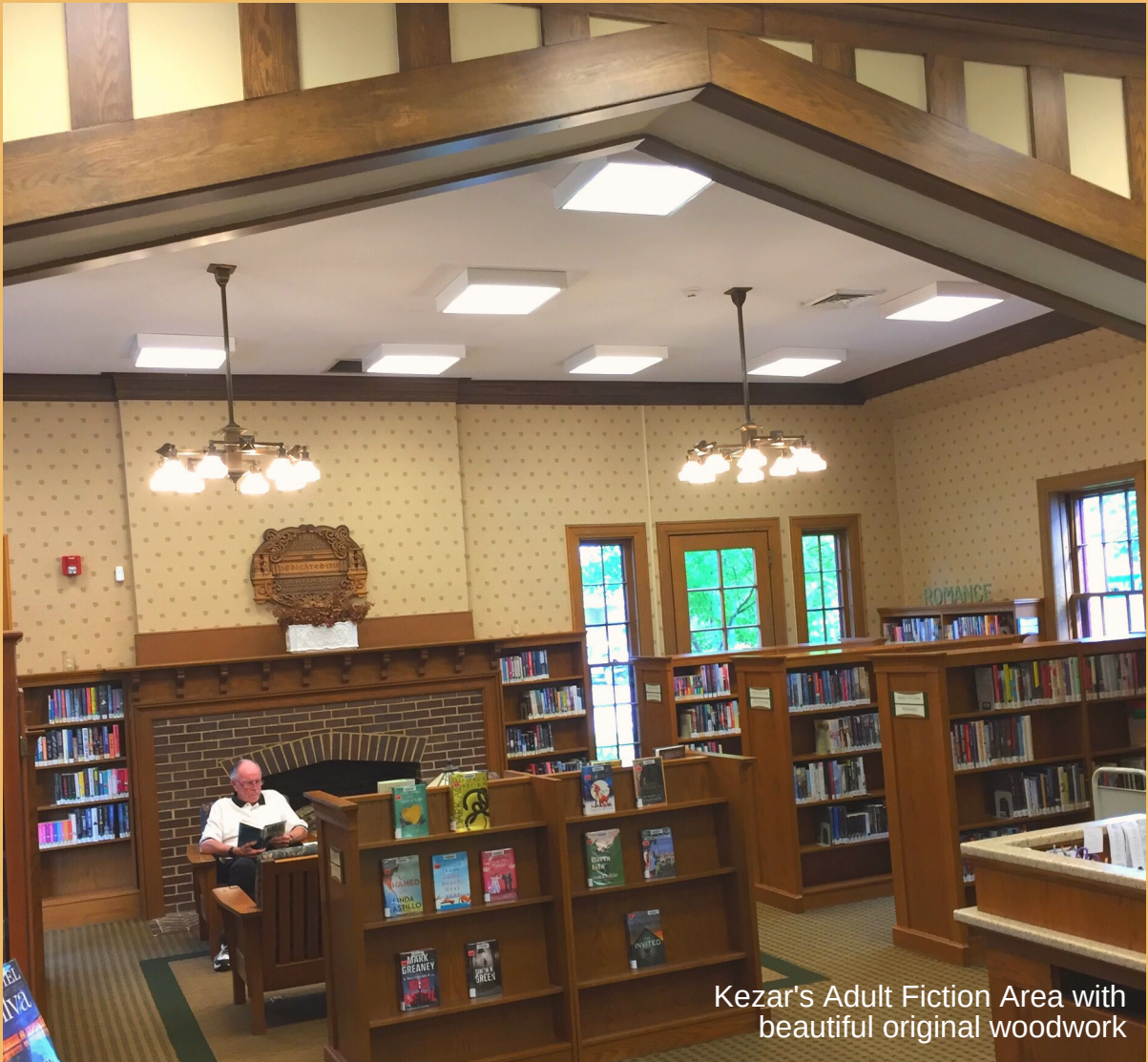
Kezar's Adult Fiction Area with beautiful original woodwork