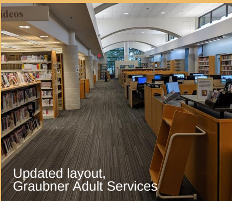
Updated layout, Graubner Adult Services