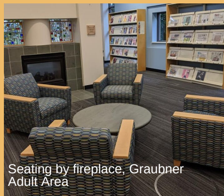
Seating by fireplace, Graubner Adult Area